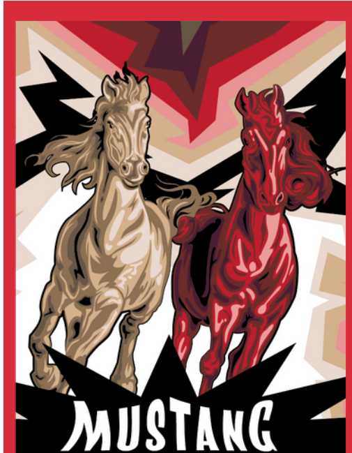
2022 Mustang Stout artwork courtesy of Byway Brewing

We were thrilled to be able to nearly double our grant-making budget to $40K to offer students even greater opportunities for innovative and experiential learning across our five schools. MEF events were also back in person this year with the return of our annual Jeans & Jerseys fundraiser as well as a new partnership with the Munster Civic Foundation and the Munster Chamber of Commerce's Light the Night event. It was great to see our community come together again in support of our schools! We would like to extend our gratitude to all of the donors, volunteers, and sponsors who made this year possible!